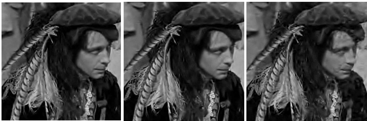
Fig. 3. Portions of reconstructed 1024 \times 1024 image Man using iterative thresholding. Left: SFE with ideal random permutation, PSNR=27.6dB; Middle: SBHE with B = 32 and LCP scrambler, PSNR=27.8dB; SBHE B = 32 and RPRI crambler: PSNR=26.5dB.