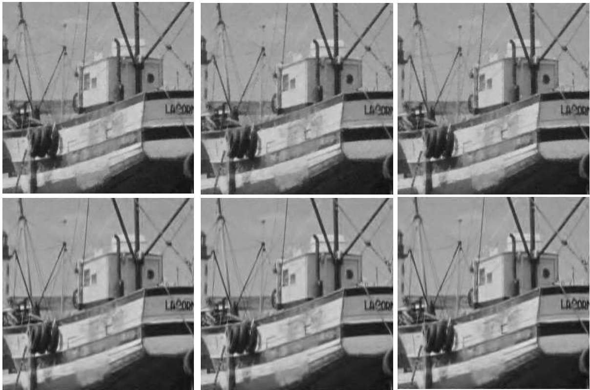
Fig. 2. Reconstructed 256 \times 256 Boats with M = 20,000 samples. First row: min-TV reconstruction [11]. Second Row: Iterative thresholding reconstruction [14]. In each row, left: results of the dense SFE and ideal random permutation; middle: results of the SBHE with B = 32 and an LCP scrambler; right: results of the SBHE with B = 32 and an RPRI scrambler;